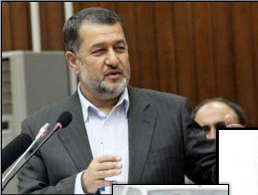
Minister of Interior Bismillah Mohammadi